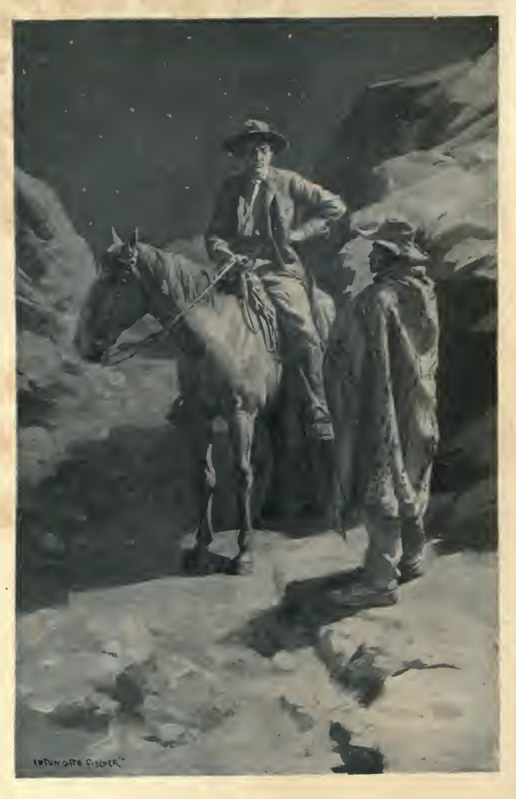
A figure detached itself from the blot of darkness, and stood almost at his stirrup. Frontispiece. See page 117.